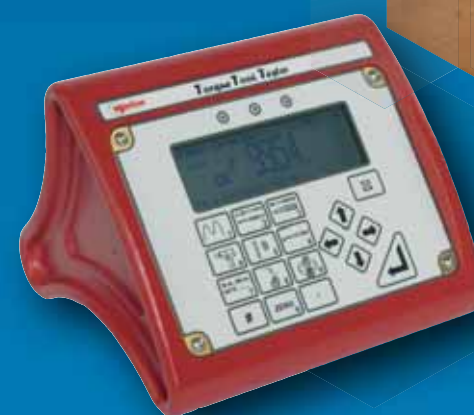
Torque Tool Tester - TTT