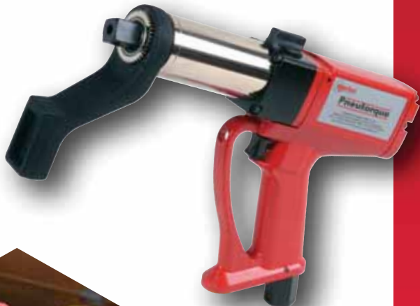
Pneutorque® PTM-52 Series Stall Model