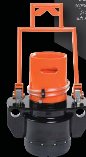
Example of an engineer to order project for the sub sea industry

These projects range from modified torque wrench end fittings to complete torque and angle control of multi-spindle nut runners. Relevant European safety directives are applied where appropriate, leading to well engineered, reliable products that are designed to make tasks safer and easier.