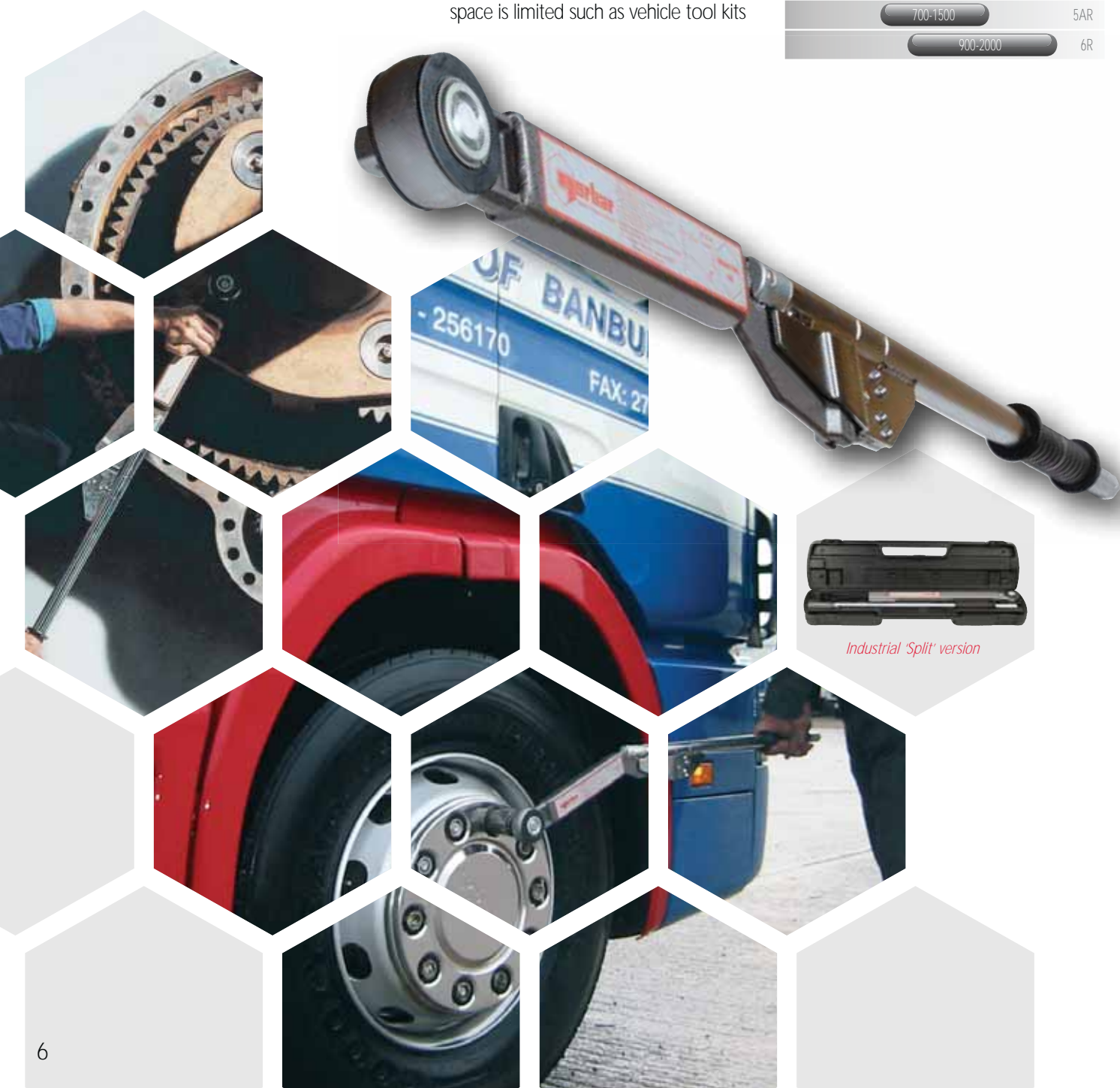
Industrial 'Split' version