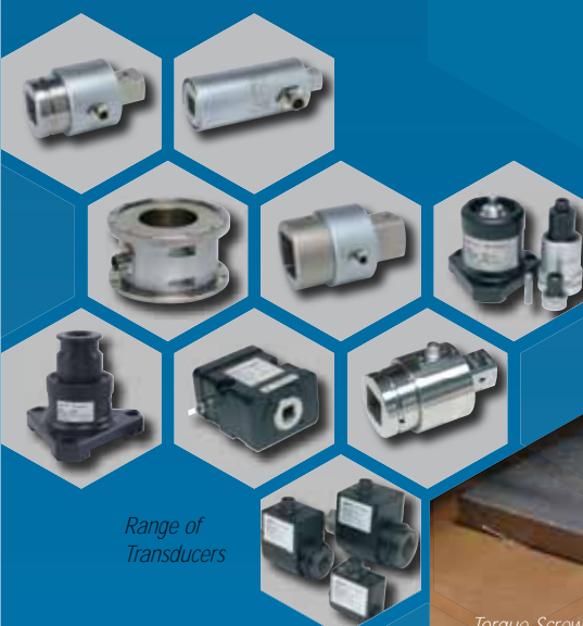
Range of Transducers