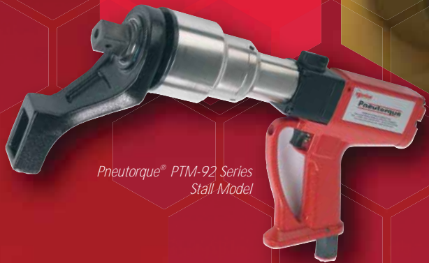
Pneutorque® PTM-92 Series Stall Model