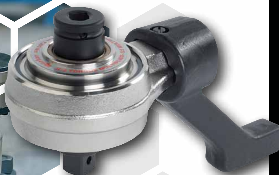
HT3 1300 N·m