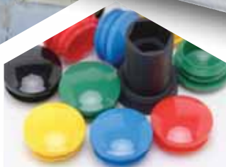
Professional 'P' Type Torque Wrench