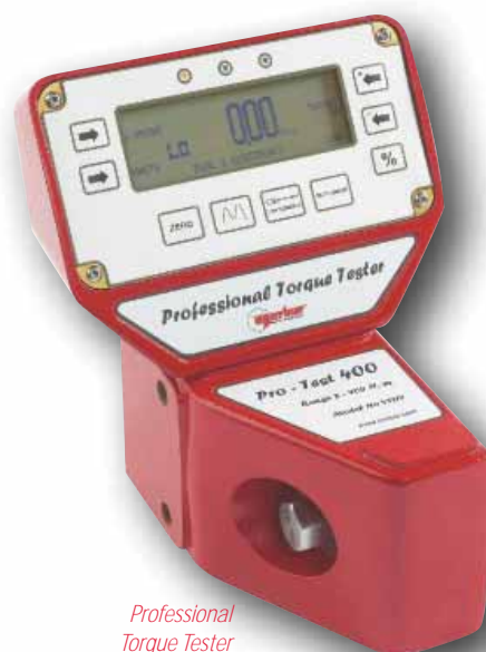
Professional Torque Tester - Pro-Test