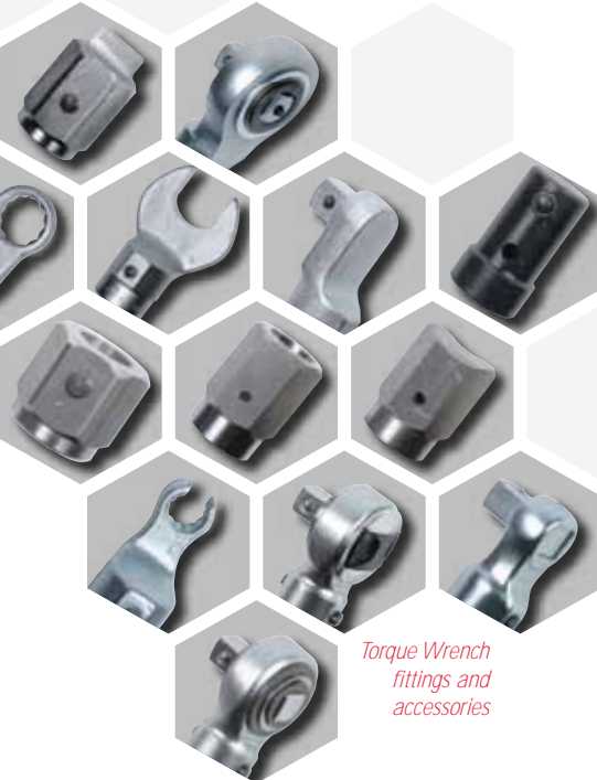
Torque Wrench fittings and accessories