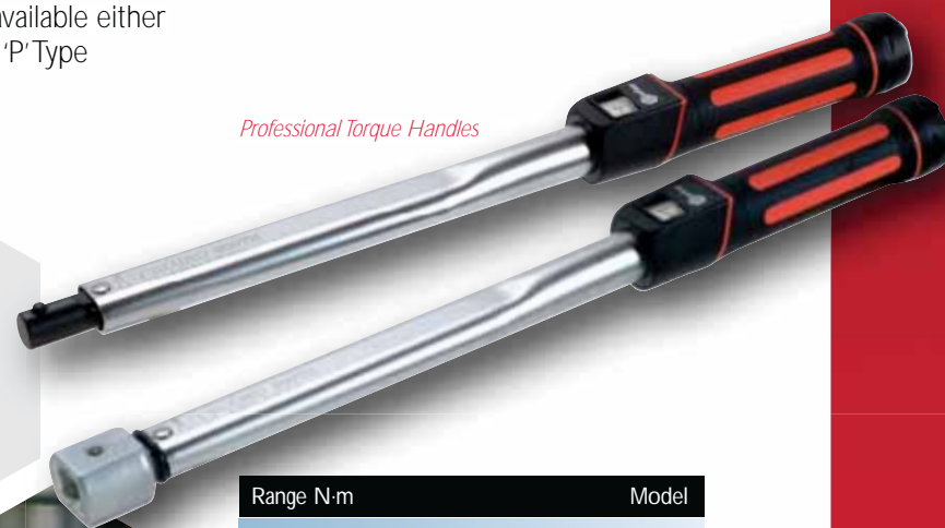
Professional Torque Handles